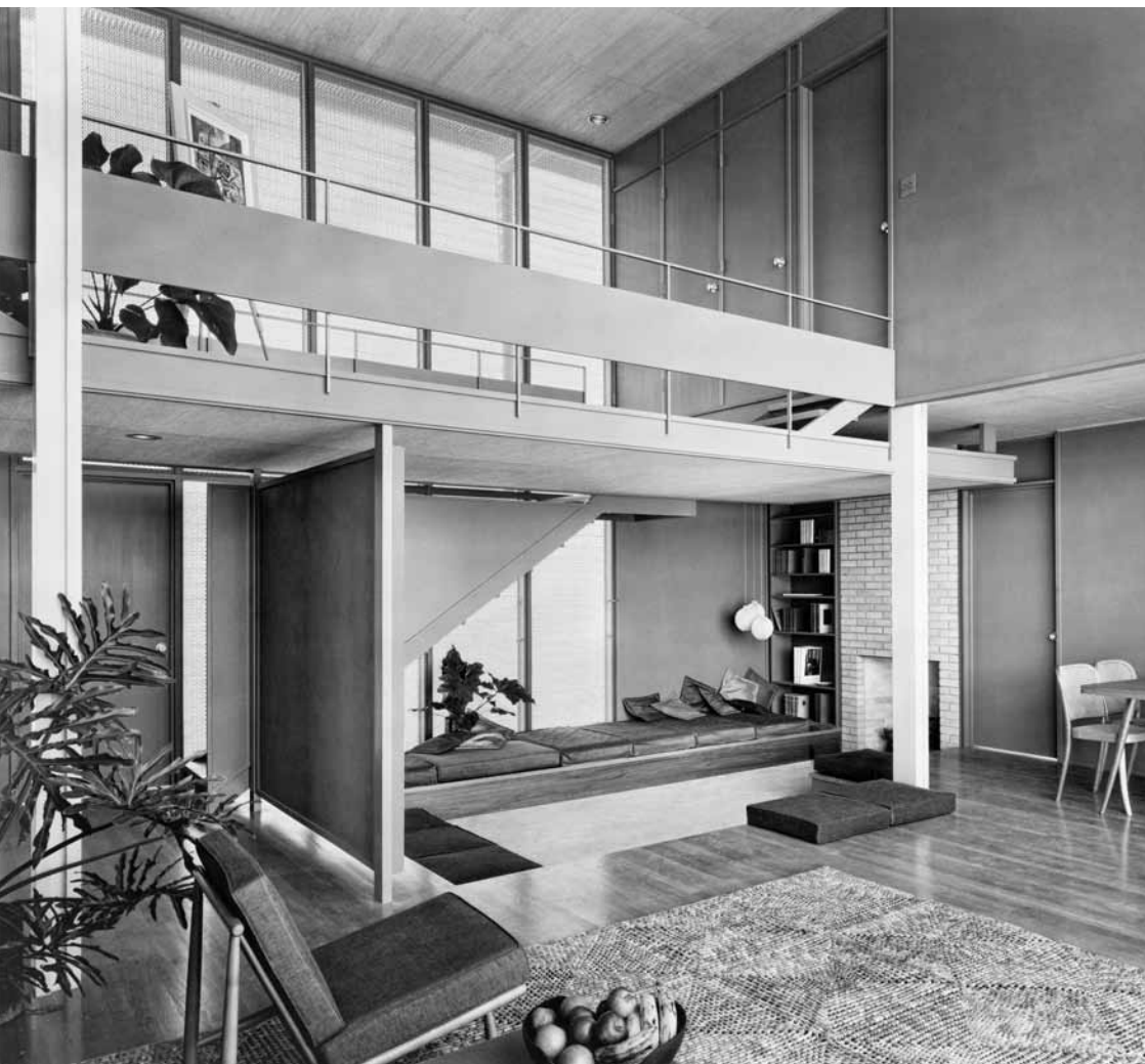
Umbrella House, Sarasota, Florida, 1953. Architect: Paul Rudolph. Rudolph's primary concern here is creating an architectural space to be perceived and experienced on his terms. The muscularity so evident in the concrete structures of his later career is foreshadowed here in the articulation of the tectonic and space-defining elements, including the tension generated between the dynamism of the space and the delicacy of the slender structure and railing supports.