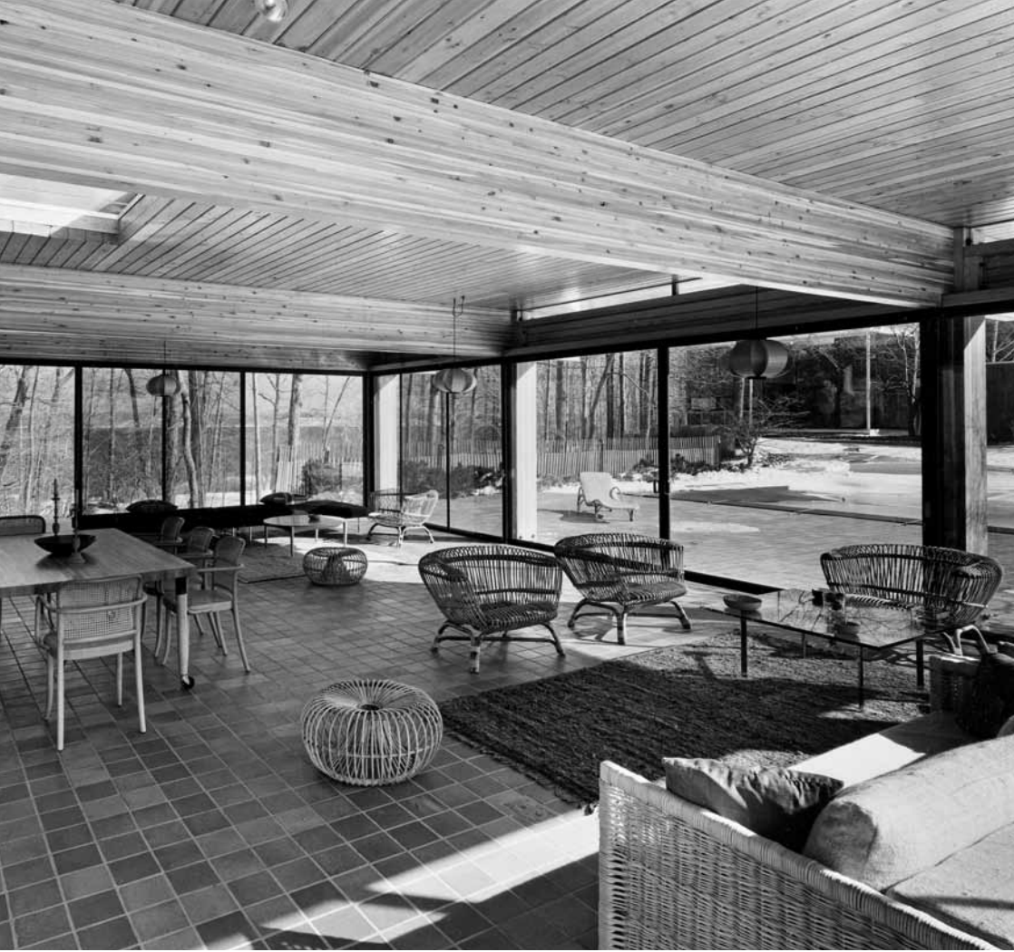
Burke Pool House, Oyster Bay, New York, 1961–62. Architect: Benjamin Thompson & Associates. Thompson's version of "Miesian" universal space features heavy exposed-timber framing in opposition to the weightless, but perfectly proportioned, Platonic clarity demonstrated most famously in Mies van der Rohe's 1951 Farnsworth House. Despite claims to universality and therefore flexibility, Mies was in fact very prescriptive about the placement of furniture and objects. In the Burke Pool House, Thompson clearly leaves those decisions entirely up to the users.